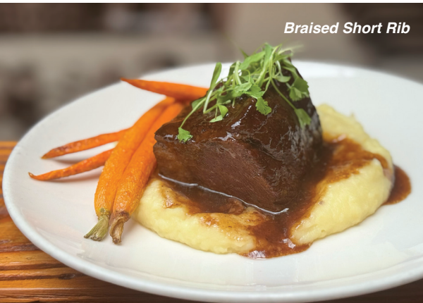
Braised Short Rib

Roasted Brussels Sprouts | Fried Pork Belly Blue Cheese Crumbles | Honey Balsamic Vinaigrette